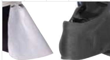
Aluminised or Wool-Nomex neckcurtains