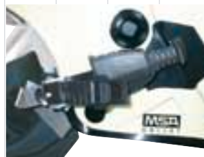
Facemask rapid fitting system